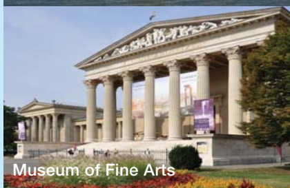
Museum of Fine Arts