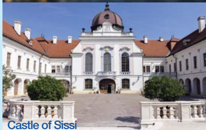
Castle of Sissi

6 days from £1,199 Departing 27th April 2020