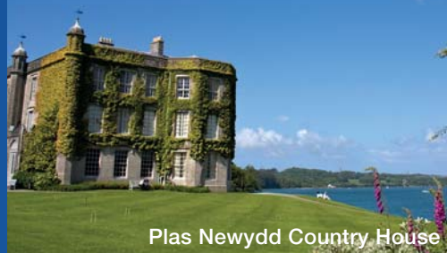
Plas Newydd Country House

View and share this tour online - click on View Your Tour at www.tailored-travel.co.uk and quote ricd222